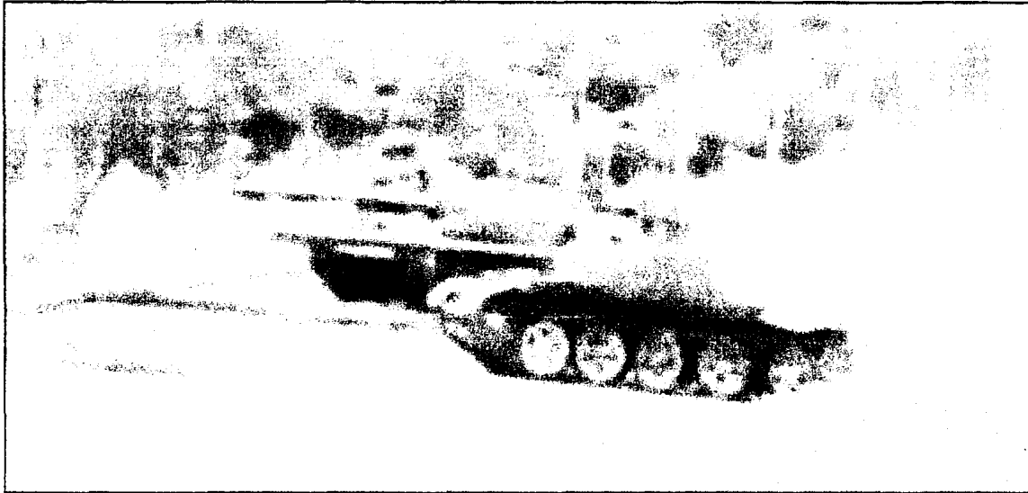
Syrian Army tanks firing into Baba Amr neighborhood, Homs

Feltman and Flynn agreed that integrating communications with the resistance within Syria was essential, and they reached out via the LCCs as the civilian authority. This approach established the Allied belief that rule of law and civilian authority over fighting units was critical to the post-conflict demobilization and reconstitution of the Syrian Armed Forces.