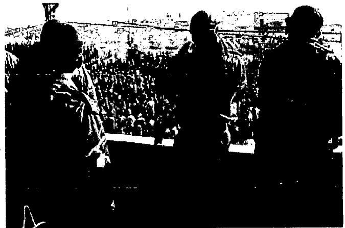
Armed men are often deployed to protect protesters

By the end of April, individuals in Homs' Bab Amr and Bab Sbaa neighbourhoods took up arms to defend themselves. At first they used shotguns and hunting rifles, along with rocks and improvised weapons. In Homs, the first armed group was established in Bab Sbaa in May. Likewise, the first accounts of armed resistance in Idlib, Deraa, Damascus and its suburbs date from late April.