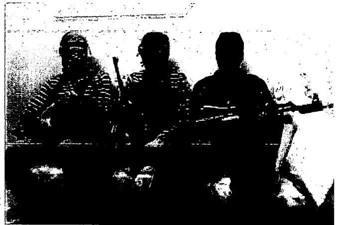
While the resistance is becoming increasingly well-armed, some groups complain they don't have enough weapons

Because there are many small groups in the armed opposition it is difficult to describe their ideology in general terms. The Salafi and Muslim Brotherhood ideologies are not important in Syria and do not play a significant role in the revolution. But most Syrian Sunnis taking part in the uprising are themselves devout. Many fighters were not religious before the uprising, but now pray and are inspired by Islam, which gives them a creed and a discourse. Many believe they will be martyred and go to paradise if they die. They are not fighting for Islam but they are inspired by it. Some drink alcohol, which is forbidden in Islam, and do not pray. And their brothers in arms do not force them to pray.