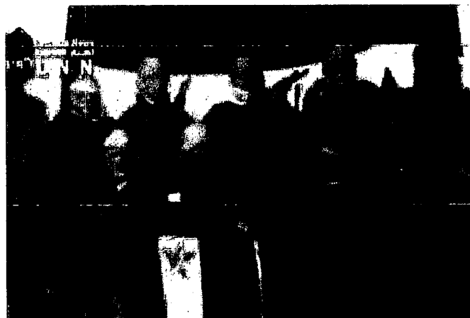
Videos have been posted online of men saying they have defected from the army with their guns [YouTube]

The regime is in a quandary. Its security agencies alone cannot clear or hold a village or a neighbourhood or a city. They need the Syrian army to back them up. But Syrian conscripts are often from the Sunni majority - and so is most of the opposition - from all over Syria, including from hotspots of the revolution. So it is soldiers' own brothers and cousins who are demonstrating. Moreover, when the poorly paid Syrian soldiers are deployed to an area, they fraternise with the local population. Locals feed them and let them use their mobile phones to call home. Local activists persuade them to defect and arrange for their safe haven.