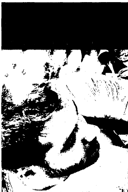
Beauty beyond culture