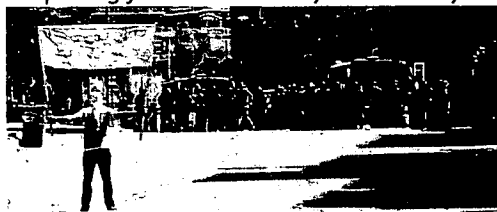
A protester faces riot police at Khalidia, near Homs

Preparing for civil war may be the only remaining way to avert it