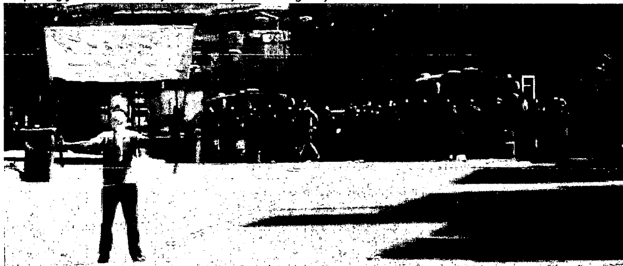
A protester faces riot police at Khalidia, near Homs

Preparing for civil war may be the only remaining way to avert it