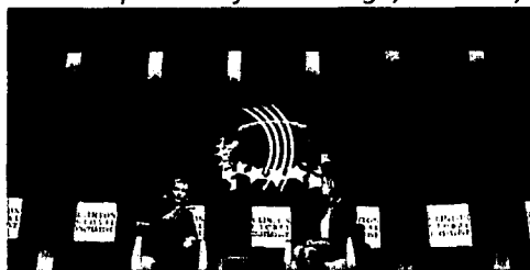
U.S. Secretary of State Hillary Clinton speaks during closing plenary of Clinton Global Initiative

Envisioning a world in which personal mobile technology can connect every human being in every village in every country to the tap roots of knowledge, markets, services, and community