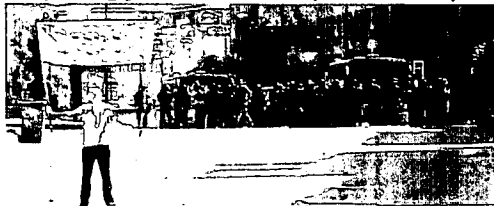
A protester faces riot police at Khalidia, near Homs

Preparing for civil war may be the only remaining way to avert it