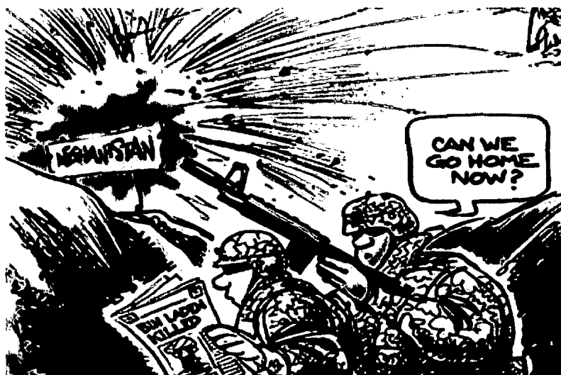
“The Nation” (05/04)