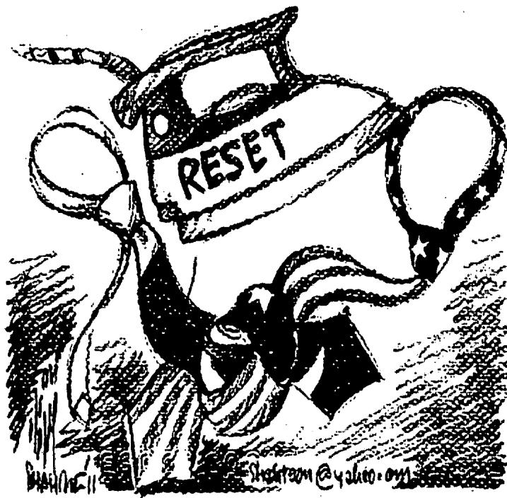
"The Statesman" (05/18)