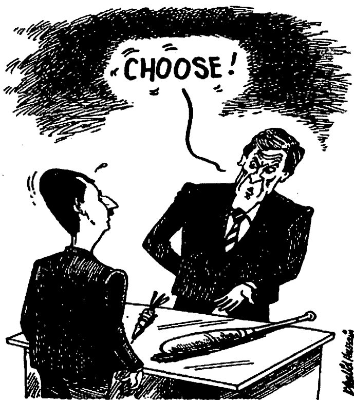
"The News" (05/18)