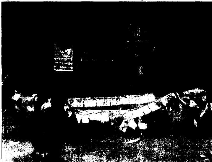
Voting lists at Ecole National Labourde

At Ecole Nationale de Laborde, a rural voting center, all appeared calm. The poll supervisor indicated medium levels of voting and assessed turnout was lower than in November. The center opened on time with no major problems; local observers, HNP, and MINUSTAH observed. Four or five voters named in the outside voting list were prevented from voting because their names were not on the BV list. Team reported about a 10 minute wait at BV 4 if names were quickly found on voting list, but overall no significant lines. Four voters used SMS system earlier this morning but said it was no longer working.